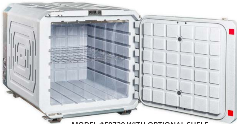
MODEL #F0720 WITH OPTIONAL SHELF